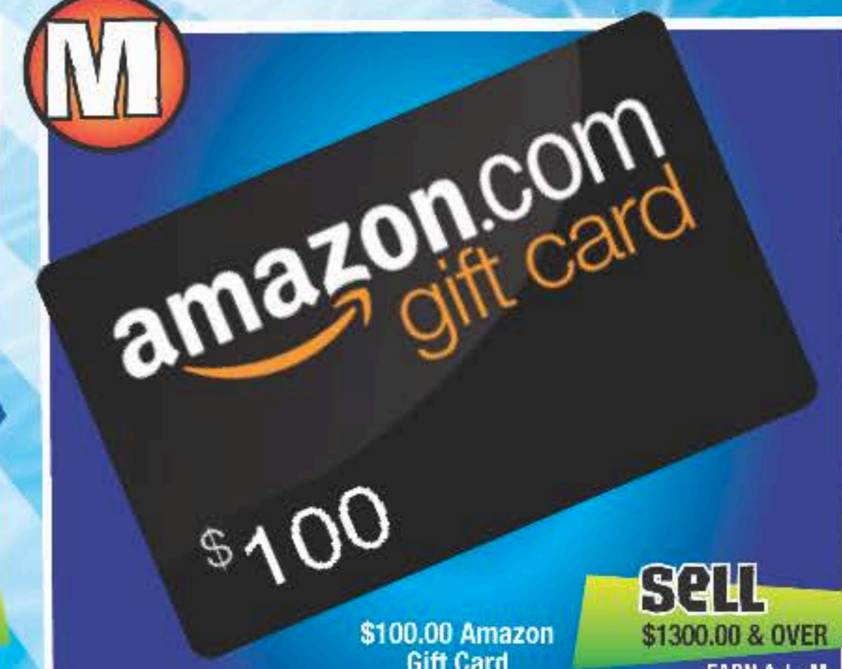
amazon.com gift card