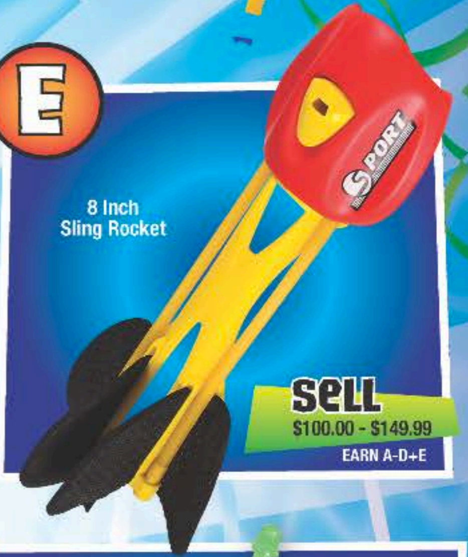
8 Inch Sling Rocket