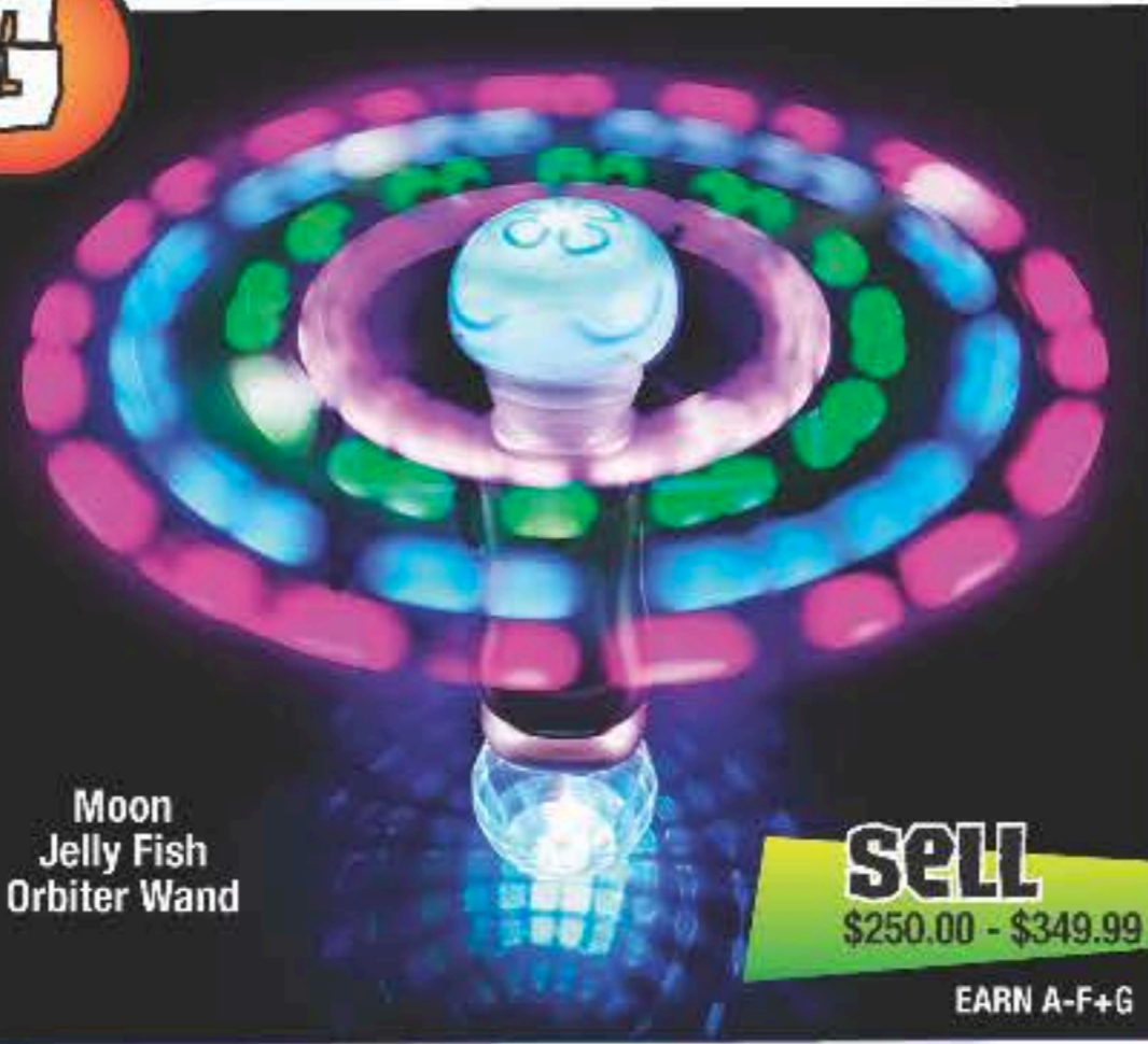
Moon Jelly Fish Orbiter Wand