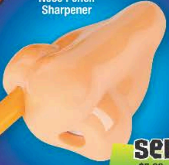
Nose Pencil Sharpener