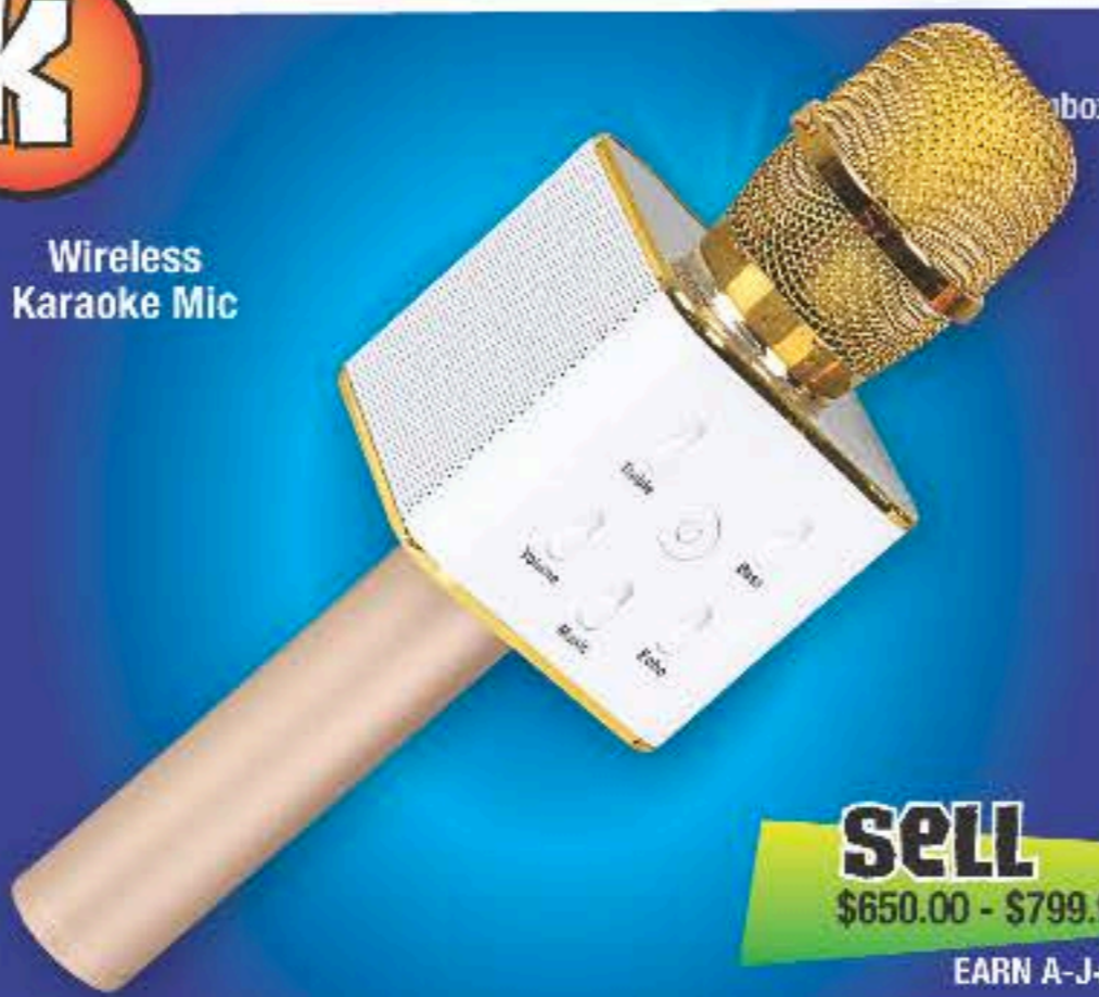
Wireless Karaoke Mic