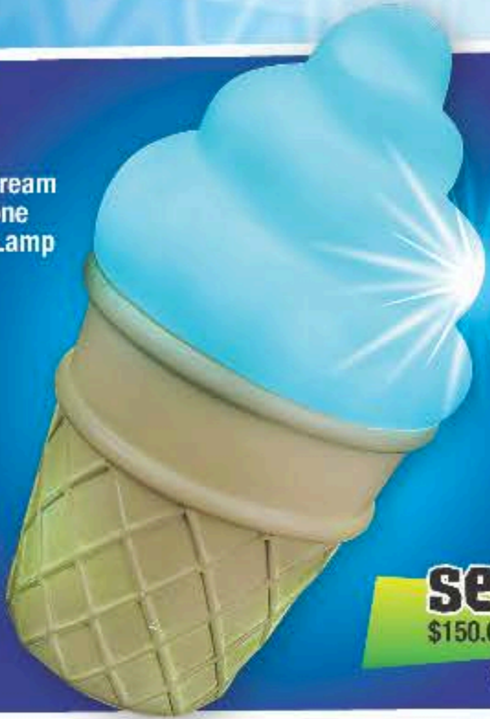
Ice Cream Cone Tap Lamp