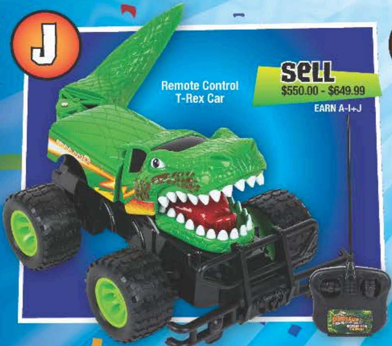
Remote Control T-Rex Car