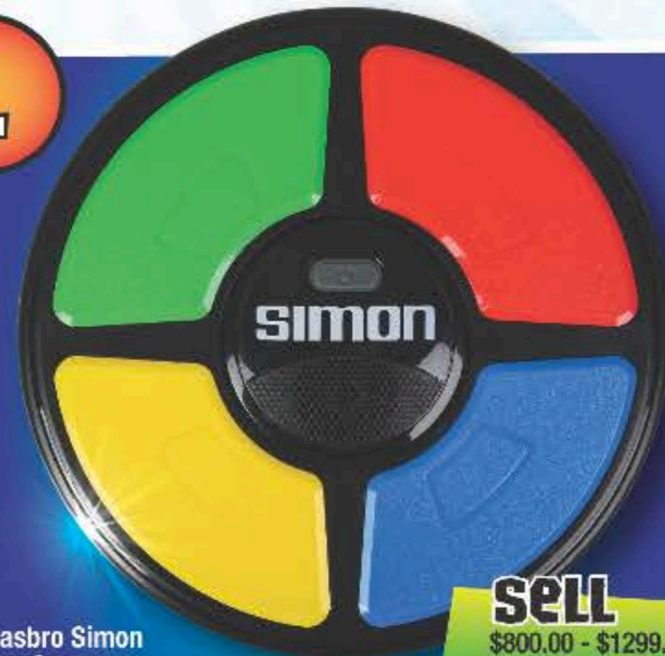
Hasbro Simon Game