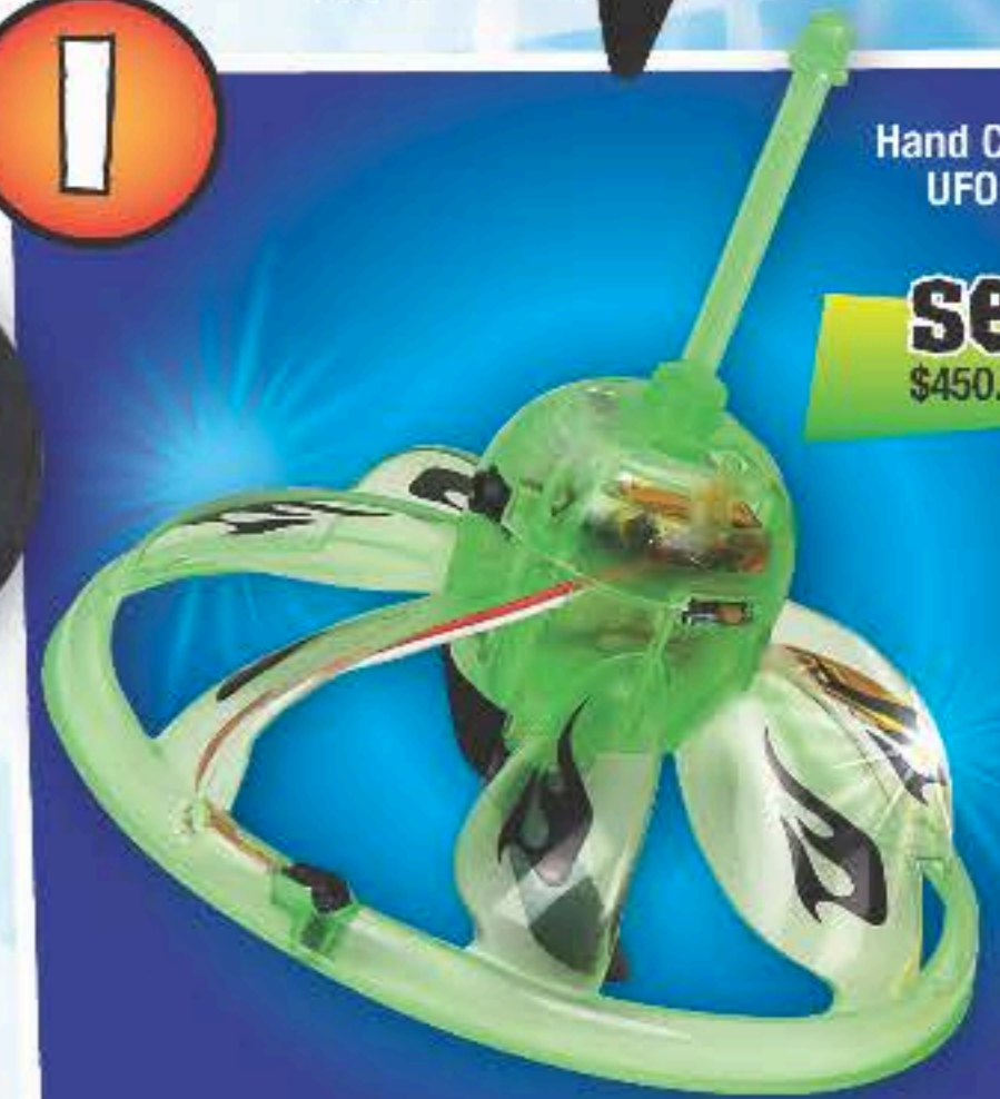
Hand Controlled UFO Drone